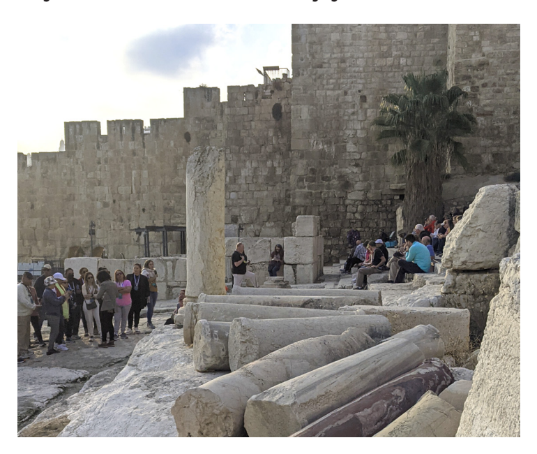
Day 9 - Return to the USA or Enjoy an Extension.

This morning, enjoy a walking tour of the Old City of Jerusalem along the Cardo, once the main street of the city. Remember how Jesus healed on the Sabbath when you visit the Pool of Bethesda (John 5: 1-18). At Herod's Antonia Fortress (Luke 23:1), see where Jesus was brought before Pontius Pilate. Walk the Via Dolorosa ("the Way of the Cross") and remember the Lord's sacrificial love at the Church of the Holy Sepulchre. Share communion together at the Garden Tomb in celebration of His Resurrection. Enjoy a free afternoon to explore Jerusalem.